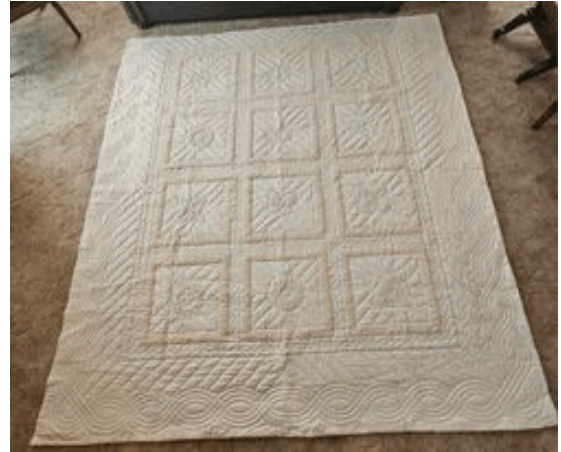
The BEAUTIFUL Quilt for January 2024 Bi-Month Quilt Raffle!